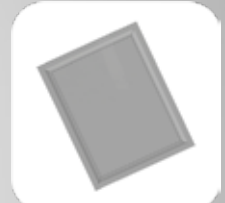
Four Side Seal