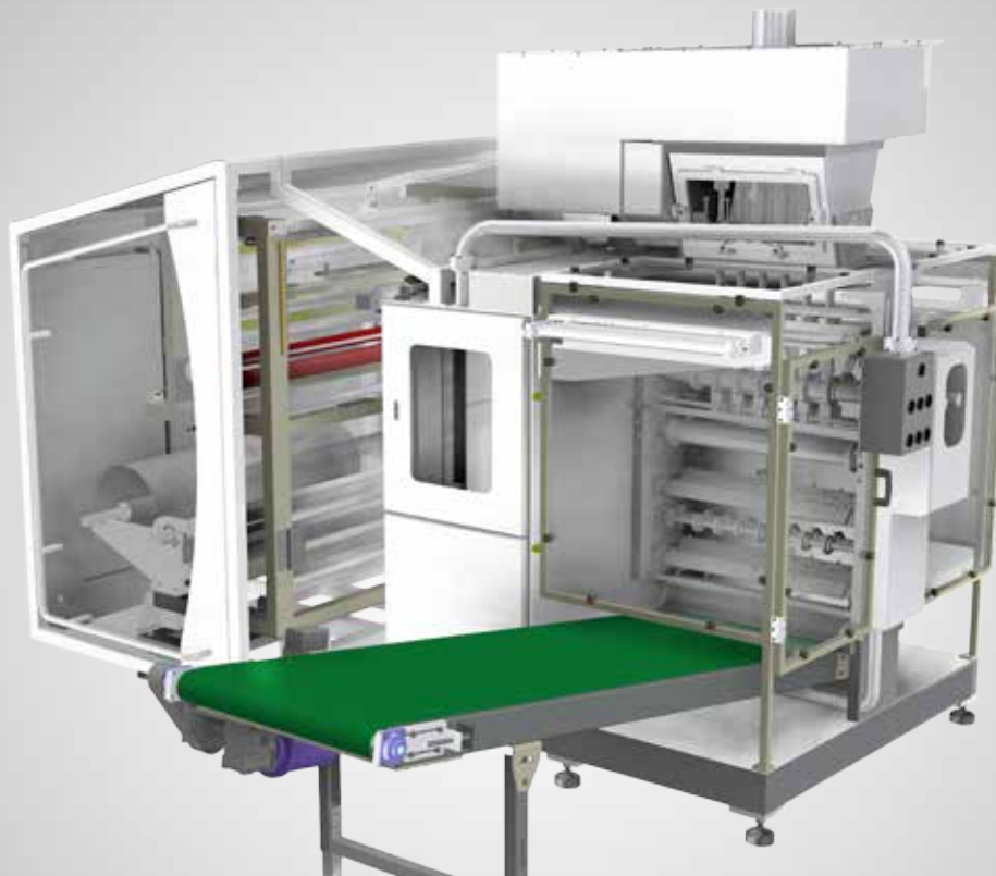
Four Side Seal